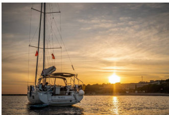
OCEANIS 46.1 - layout 4 CABINS & 2 HEADS